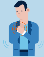
Chest discomfort or pain